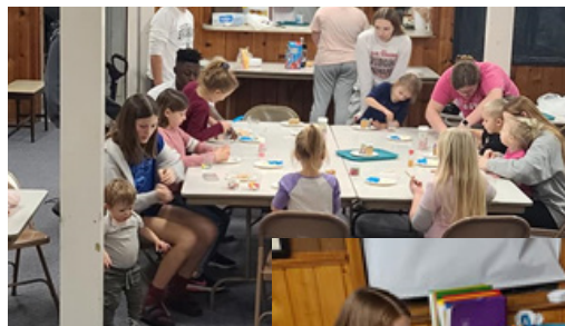
Youth Group helping make Gingerbread Houses.